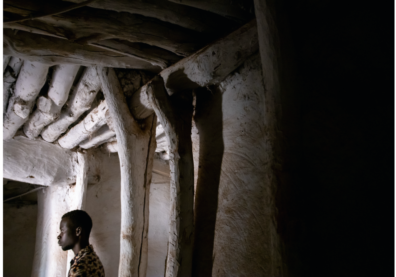
Iwan Baan (*1975) Grand Mosque, Bobo-Dioulasso, Burkina Faso, The ancient natural wooden construction typical of Sudan-Sahelian architecture, of which Bobo-Dioulasso's Grand Mosque is one of the few remaining examples, 2021